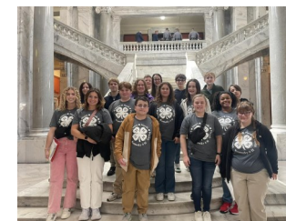
4-H Capitol Trip